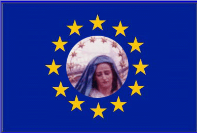
Photo of Mary with 12 star crown set within EU circle of stars. The blue of her mantle matches that of the flag.

In spite of the evidence, some would still argue that the Marian symbolism is merely a co-incidence and that the EU flag was chosen as a non-sectarian, neutral symbol that all the peoples of Europe can identify with and accept. Any suggestion otherwise is relegated to the realms of fallacious conspiracy theories. But, can this be dismissed so lightly?