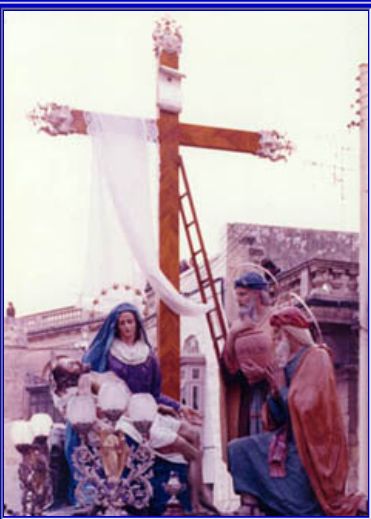
Original Photo Malta 1984

The Roman Church decreed in 1309 that Europe be consecrated to Mary and placed under her patronage.