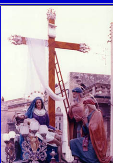
Original Photo Malta 1984