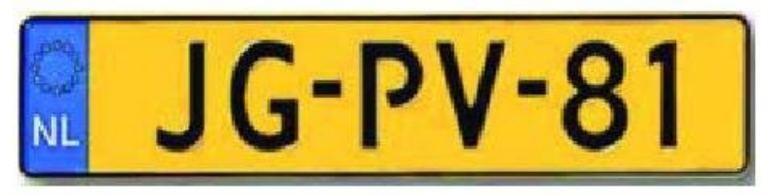
The European flag/Marian symbol appears on every license plate in the EU