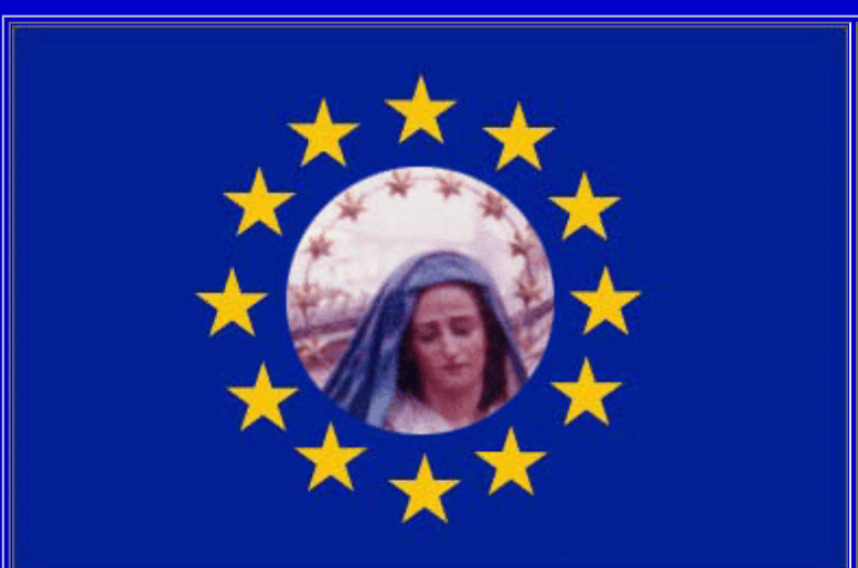
Photo of Mary with 12 star crown set within EU circle of stars. The blue of her mantle matches that of the flag.

In spite of the evidence, some would still argue that the Marian symbolism is merely a co-incidence and that the EU flag was chosen as a non-sectarian, neutral symbol that all the peoples of Europe can identify with and accept. Any suggestion otherwise is relegated to the realms of fallacious conspiracy theories. But, can this be dismissed so lightly?